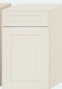
Duraform Breeze with Harbor Box