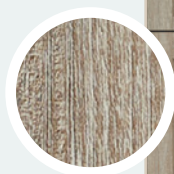
Duraform Drift enlarged to show texture