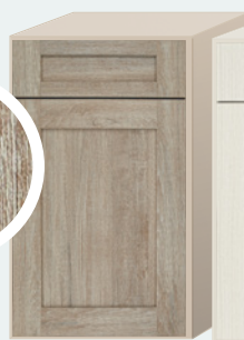
Duraform Drift with Oat Box